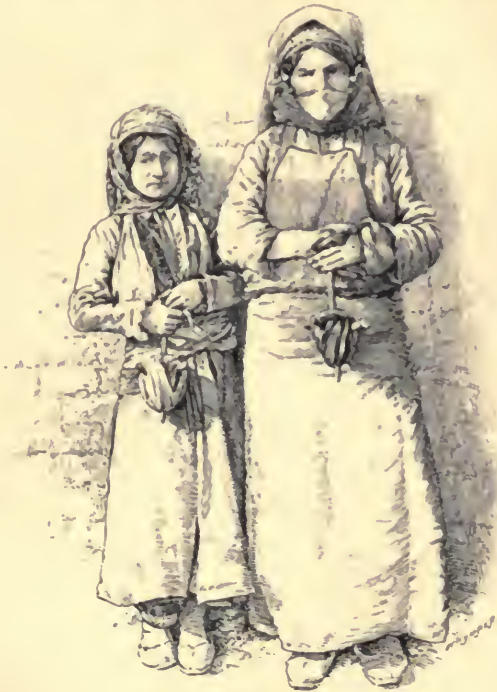
ARMENIAN WOMEN OF LIBASGUN.

my hair, the conversation flagged, for I could not get any information from them even on the simplest topics. Hotter and hotter grew the room, more stolid the vacancy of the eyes, more grotesque the rows of white diamonds over the mouths, when the happy thought occurred to